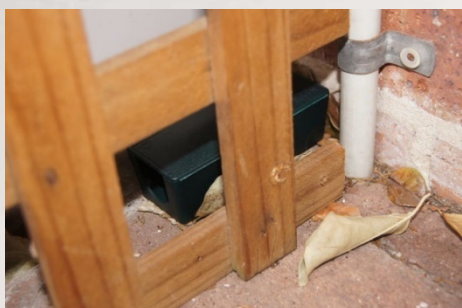
A Generation PBS applied next to a water tank, in a residential house