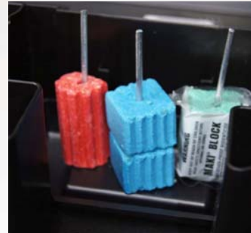
Smaller size of Generation blocks compared to other baits

Its formulation contains high quality cereals and attractants to maximise bait uptake.