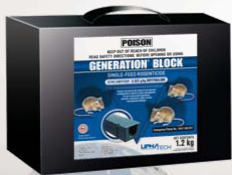
Generation PBS come in a carry-case of 60 units

Generation Pre-Baited Stations (PBS) are a unique offering for Australian pest managers. Designed to replace unsafe cardboard stations the Liphatech product is a ready-to-use tamper-proof station containing one Generation Block.