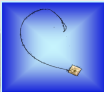
Aegis® Stick & Go tethering cables

This bait station securing cable is easy to use and quick to install.