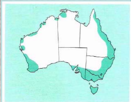
Figure 4: Distribution of the black rat ( Rattus rattus ) in Australia according to Strahan (1995).

Black rats are the most widespread species of rats in Australia and PCO's are likely to come across most often when performing rodent control activities.