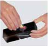
POSITION bait or lure before arming