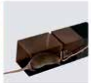
CATCH: Metal bar triggered by mouse

PLACE Mouse Trap on rodent pathways. Remember that mice also travel up and down.