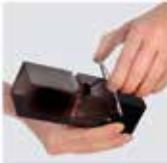
ARM the trap