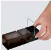
SET the trap in chosen area